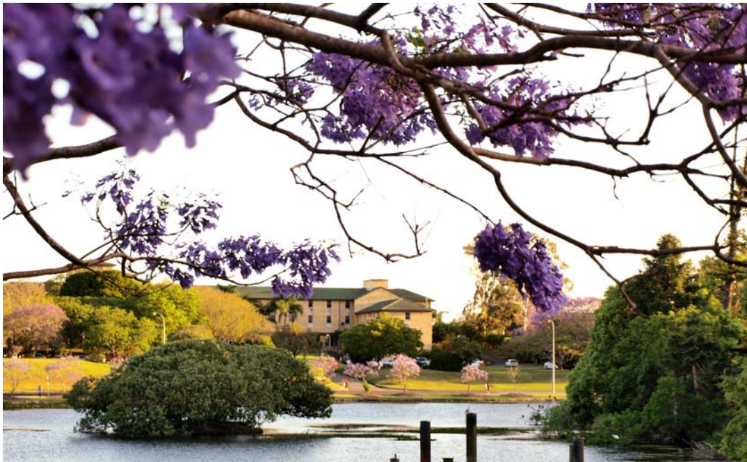
The front of Duchesne College from across the lake amidst the jacaranda blooms on a late spring afternoon.

This newsletter is also available electronically at: www.uq.edu.au/duchesne